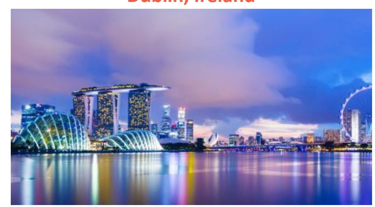
2020 Asia Conference April 22-24, 2020 Singapore