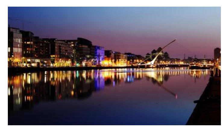
2019 European Conference October 30 – November 1, 2019 Dublin, Ireland