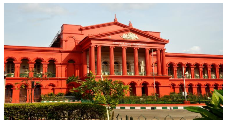
2020 International Asia Conference January 29-31 or February 5-7, 2020 Bangalore, India